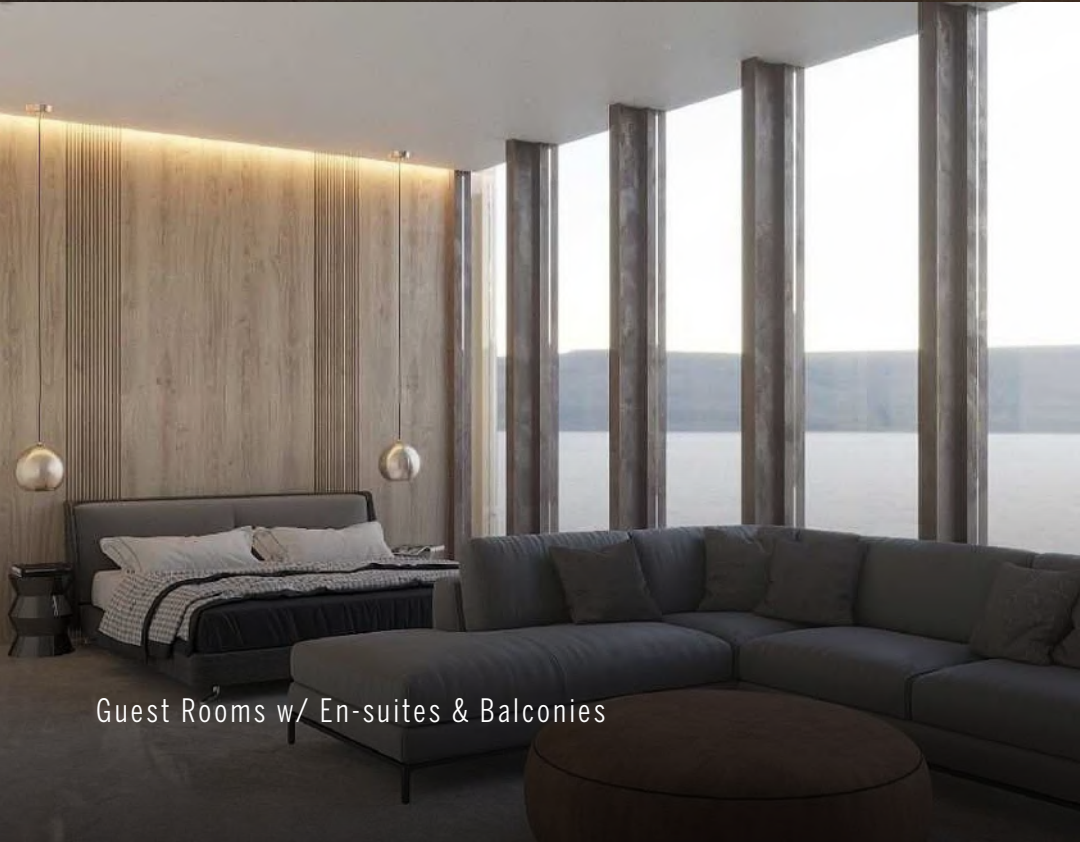
Guest Rooms w/ En-suites & Balconies