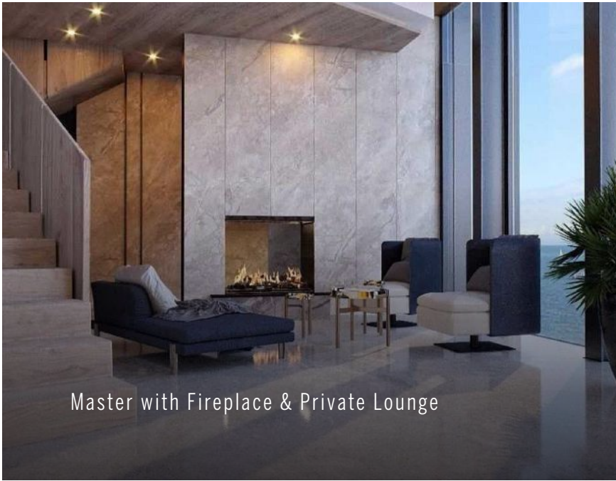
Master with Fireplace & Private Lounge