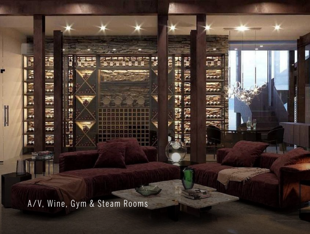
A/V, Wine, Gym & Steam Rooms