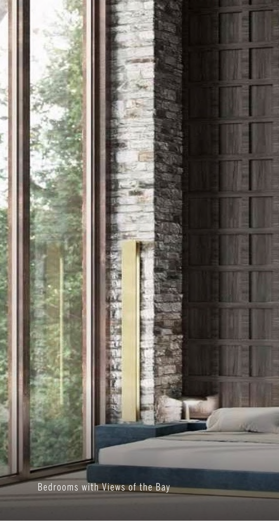
Bedrooms with Views of the Bay