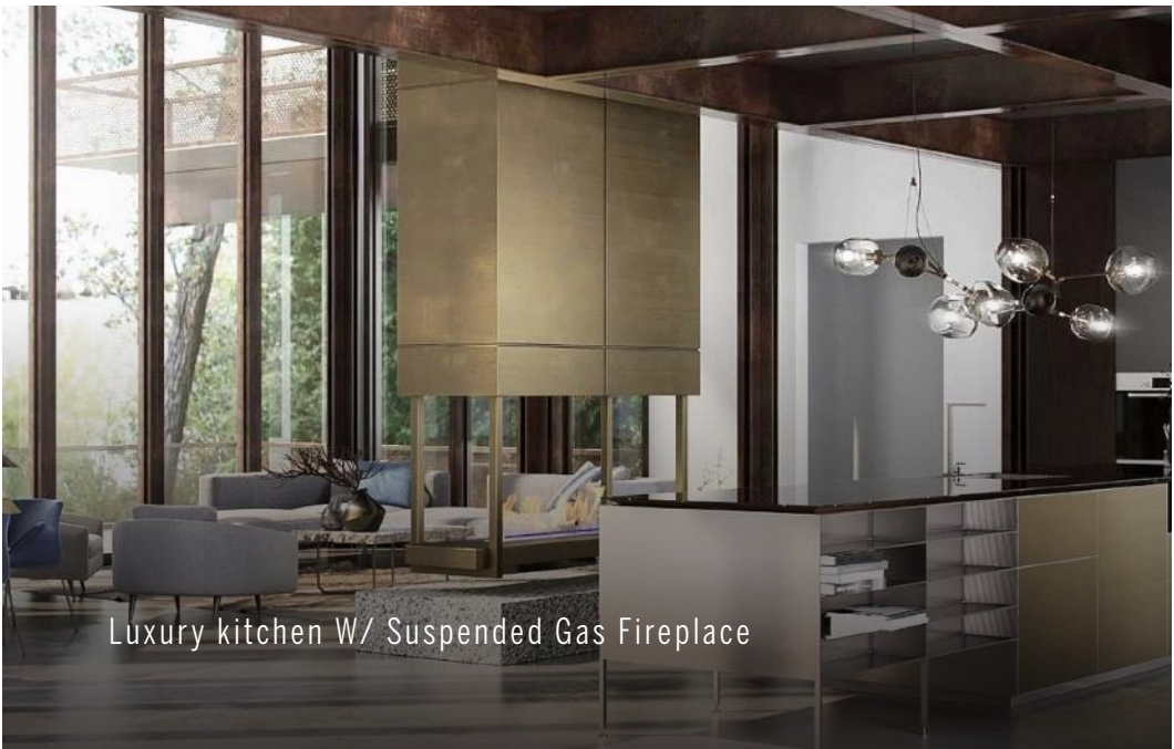
Luxury kitchen W/ Suspended Gas Fireplace