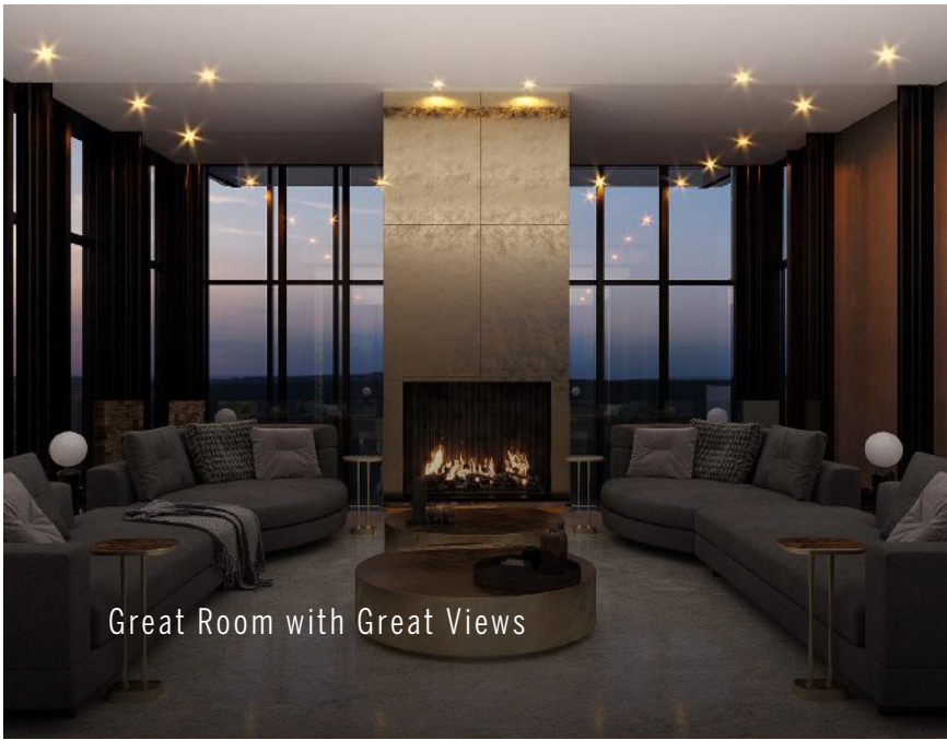
Great Room with Great Views